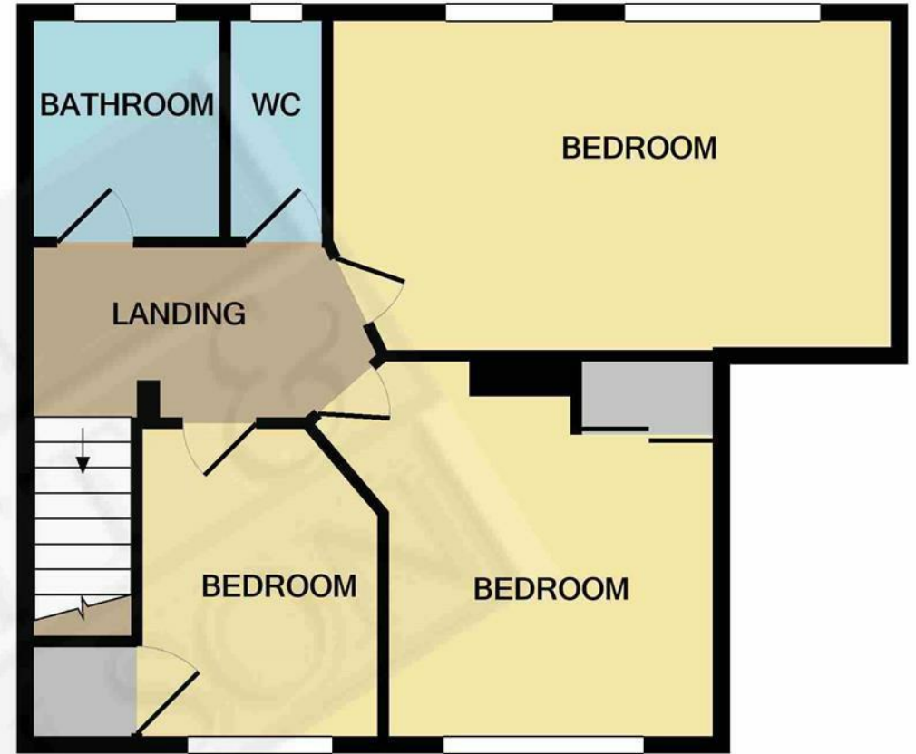
1ST FLOOR APPROX. FLOOR AREA 451 SQ.FT. (41.9 SQ.M.)

TOTAL APPROX. FLOOR AREA 854 SQ.FT. (79.4 SQ.M.)